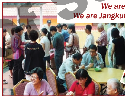
Look at that Queue! It's for ONLY the BEST - Jangkut Laksa