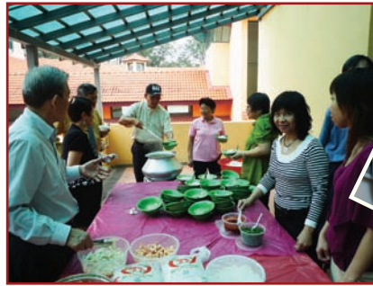
Here is the BEST Yummy and Delicious Jangkut Laksa !!!