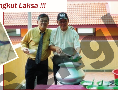
We are family, We are Jangkut Laksa Buddies