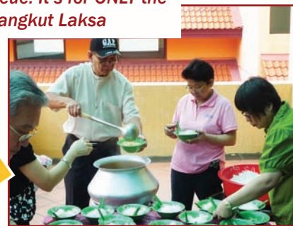
Our Jangkut Laksa Pro at work